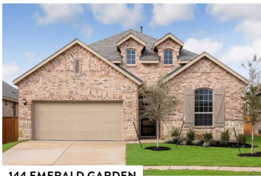
144 EMERALD GARDEN