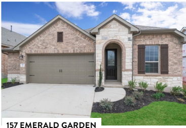
157 EMERALD GARDEN