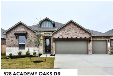
528 ACADEMY OAKS DR