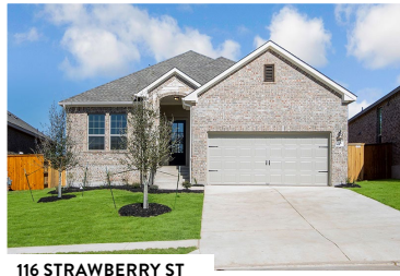
116 STRAWBERRY ST