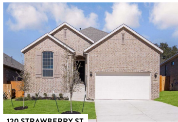
120 STRAWBERRY ST