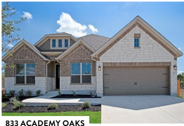
833 ACADEMY OAKS